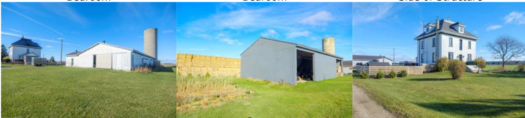
Side of Structure