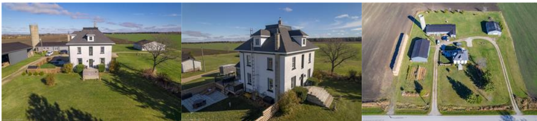
Back of Structure