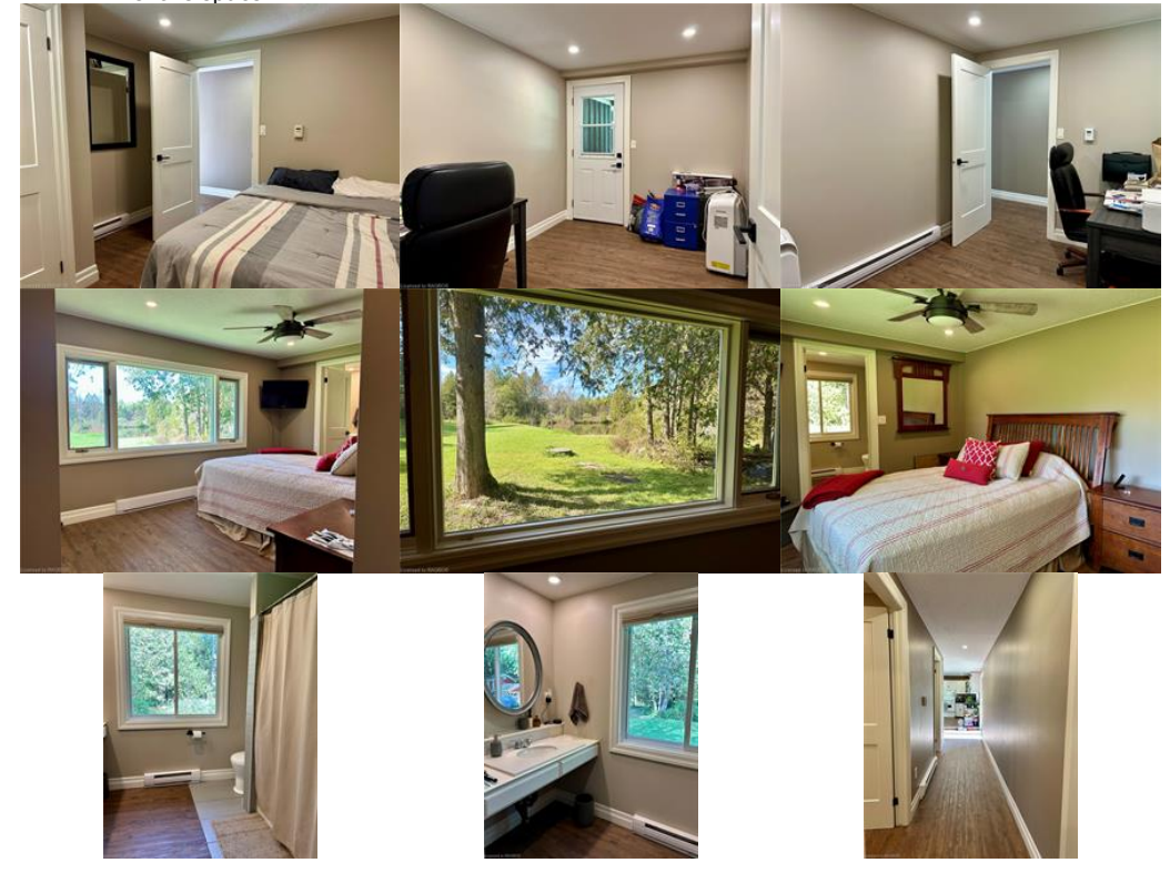
Listing ID: 40654117