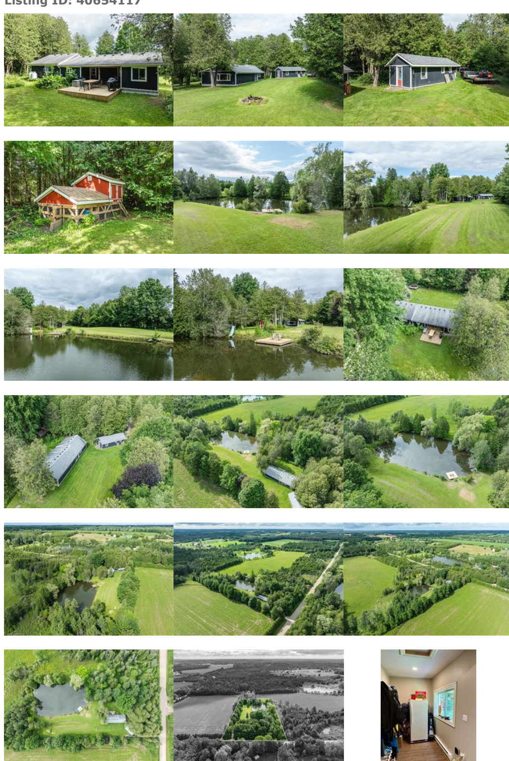
Listing ID: 40654117