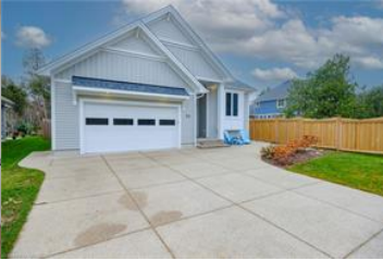
View of front facade