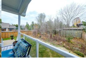
Wooden terrace featuring outdoor lounge area