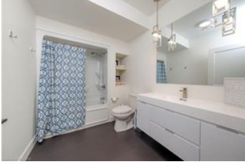
Full bathroom with shower / bath combo, toilet, and vanity