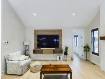
Wooden deck with a yard