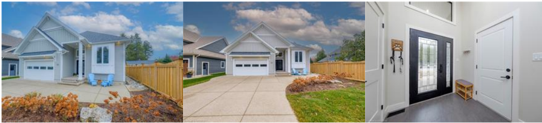
View of front of property