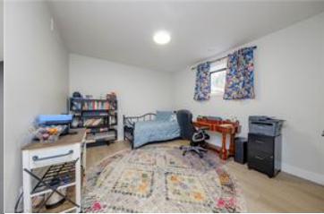
Office with light hardwood / wood-style floors and a textured ceiling