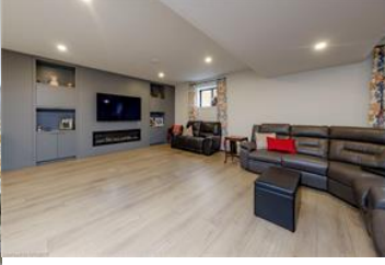
Living room featuring light hardwood / wood-style floors