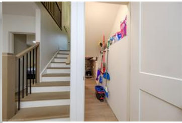
Staircase with hardwood / wood-style flooring