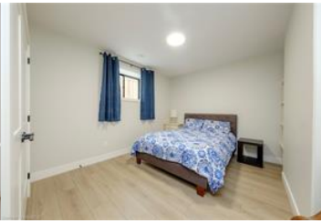
Bedroom featuring hardwood / wood-style flooring