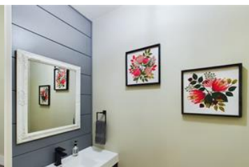
Bathroom with a shower with shower door