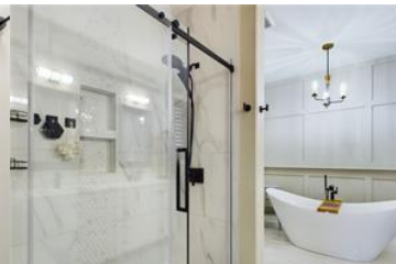
Bathroom with a bathtub, vanity, and an inviting chandelier