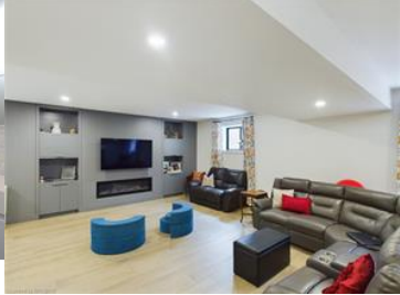
Living room featuring light wood-type flooring