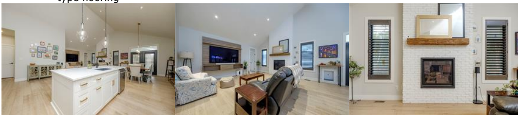
Kitchen featuring white cabinets, a kitchen island with sink, and high end refrigerator