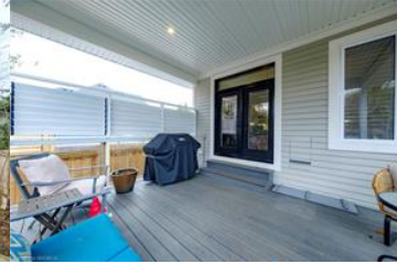
View of patio