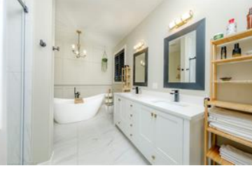
Wooden deck featuring a grill