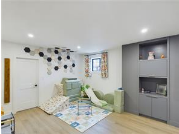
Rec room with light hardwood / wood-style flooring