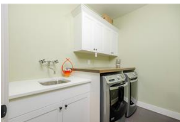
Bathroom with a bathtub