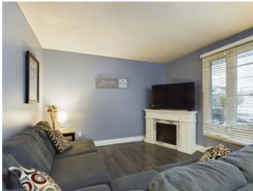
Main Floor Living Room