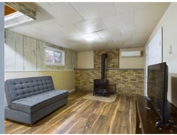
Lower Level Rec Room