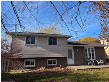
Back of Structure