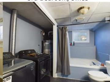
Lower Level Bathroom/Laundry Room