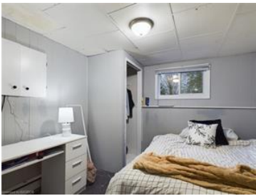
Lower Level Bedroom