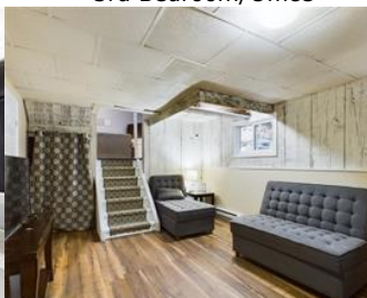
Lower Level Rec Room