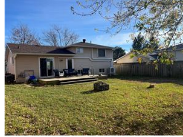
Back of Structure