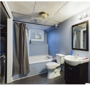
Lower Level Bathroom/Laundry Room