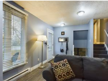
Main Floor Living Room