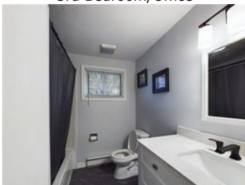
Second Floor Bathroom - 4 Piece